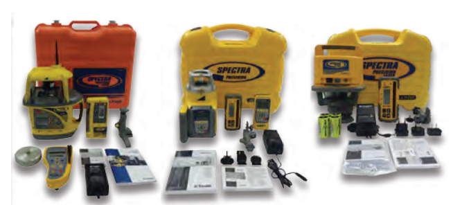
GL722 Dual Grade Laser GL622 Dual Grade Laser LL500 Single Grade Laser