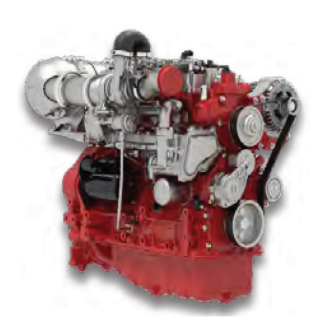
Deutz Tier 4 Interim Engine