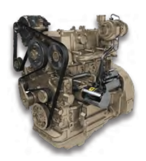
John Deere 4024 Engine