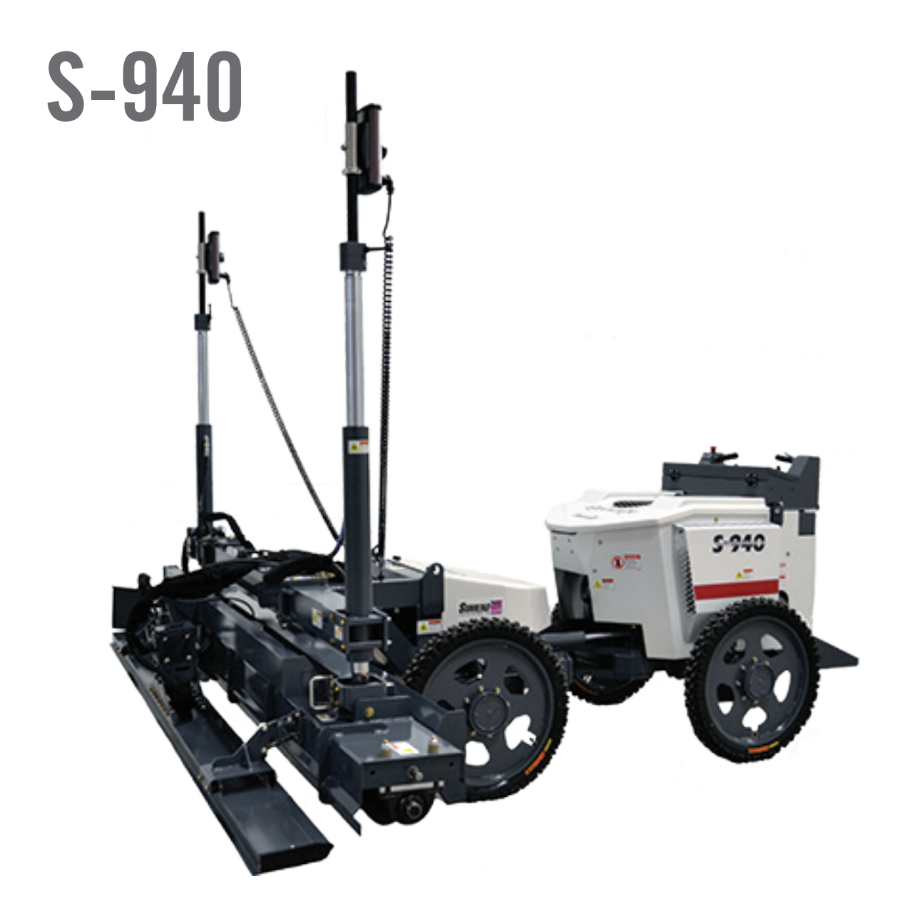
The S-940 provides unmatched versatility and simplicity with increased power and productivity! Available with a fully automated self-leveling screed head, raking/fine grade head, this powerful machine has fewer switches and an easy-access hinged console, making any job comfortable for your operator.

It has a foldable elevation beam that provides a narrower profile during transport with the added benefit of providing easy entry to jobsites. The off-set screed head provides less of an overlap per pass. With the option of a powerful diesel engine, this model is unstoppable.