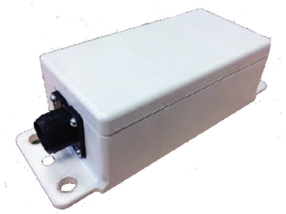
AS212-S Dual Axis Sensor