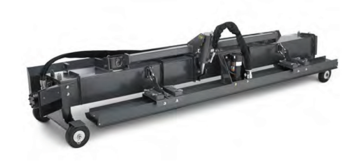
8ft Auger Head Assembly