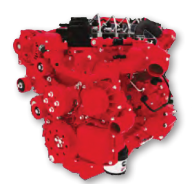
Cummins QSF2.8 Engine