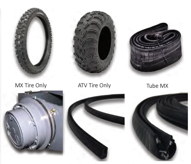
Flanged Wheel Extension Wheel Guard Seal Outer Wheel Guard Seal Inner